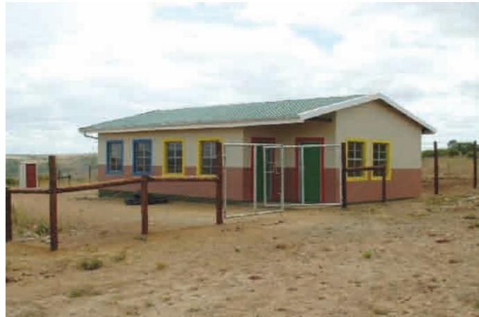
Mbhekeni Crèche with fencing and VIP Toilets