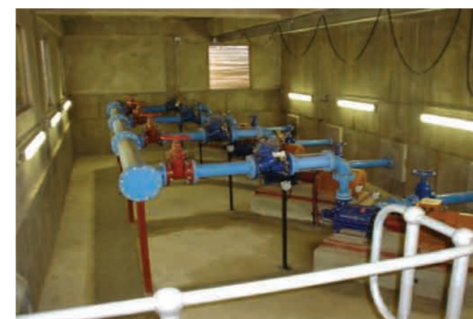
Completed Pump Station at Monzana River