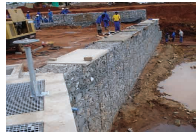
Re-enforcement of base and Gabion Protection - Monzana River Weir