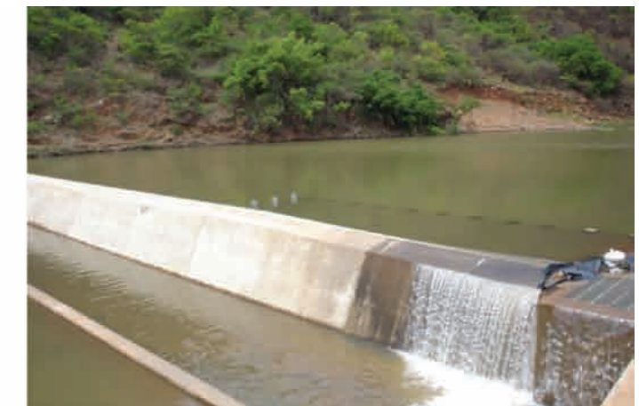
Completed Monzana River