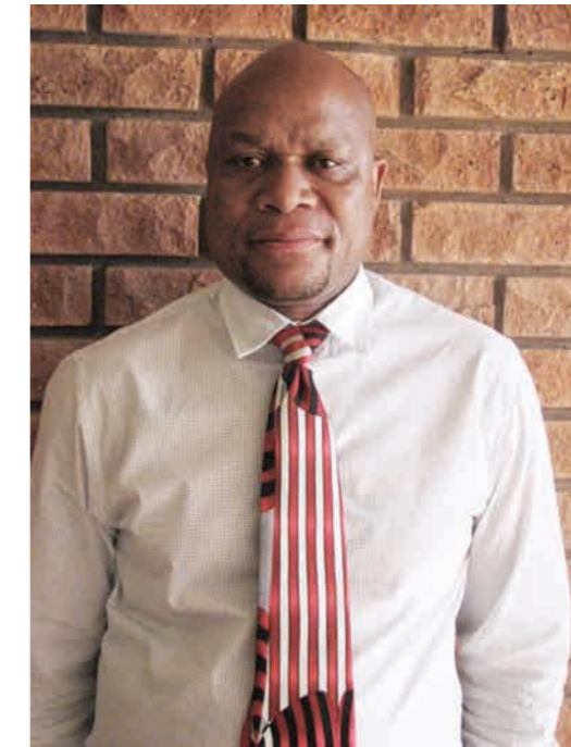
ORGANOGRAM FOR THE SENIOR MANAGEMENT: TECHNICAL SERVICES DEPARTMENT: